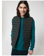
Stanley Climber Wool-Like

Shell : Plain Weave Brushed , 100% Polyester - Recycled , Fluorine-free DWR , 140 GSM